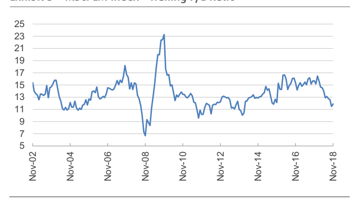
Exhibit 3 » MSCI EM Index - Trailing P/E Ratio